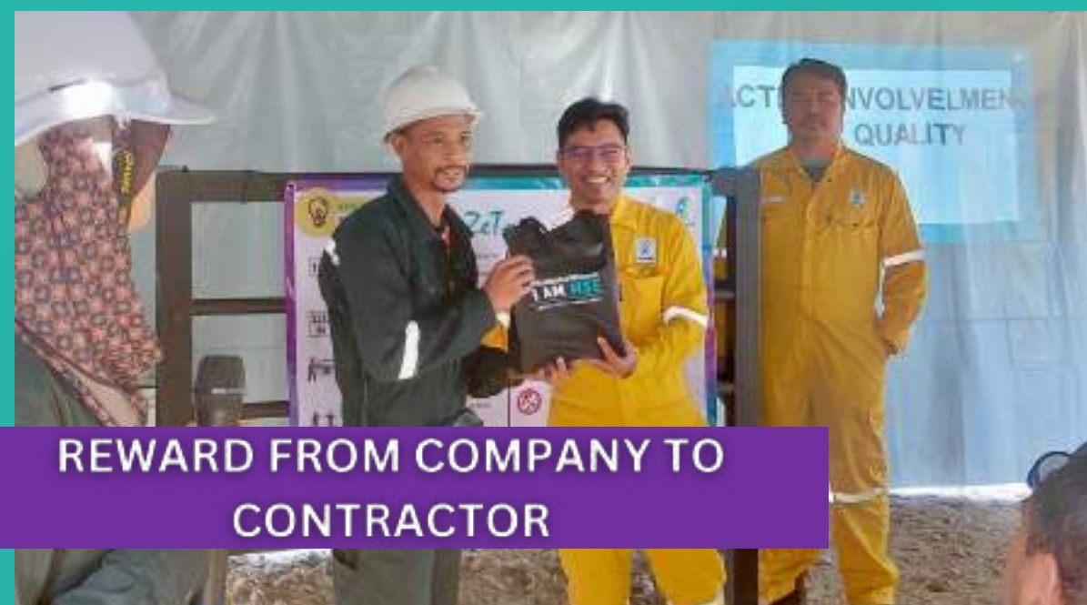
REWARD FROM COMPANY TO CONTRACTOR

This initiative aims to recognize and appreciate workers' commitment to safety and quality, motivate continued excellence, and encourage a proactive attitude toward site safety and quality improvement.