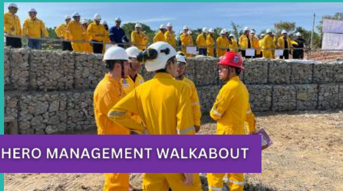
HERO MANAGEMENT WALKABOUT

This walkabout provides an opportunity for HeRO management to share their insights, encourage best practices and provide constructive feedback to ensure continued project success.