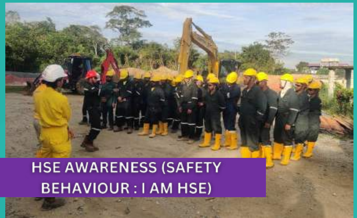
HSE AWARENESS (SAFETY BEHAVIOUR : I AM HSE)

To foster a strong safety culture and emphasize individual accountability by encouraging workers to take ownership of their actions and decisions related to HSE practices.