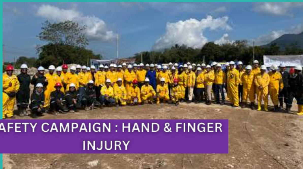
SAFETY CAMPAIGN : HAND & FINGER INJURY